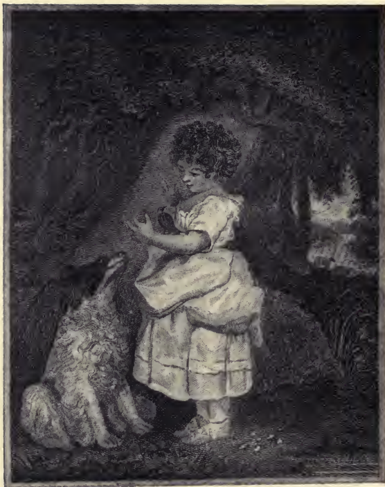
The Little Runaway